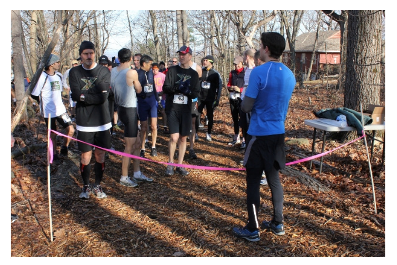
Runners waiting for the start signal at the Lost Brook Trail Run at Tenafly Nature Center, April 2, 2011. April 2, 2011.