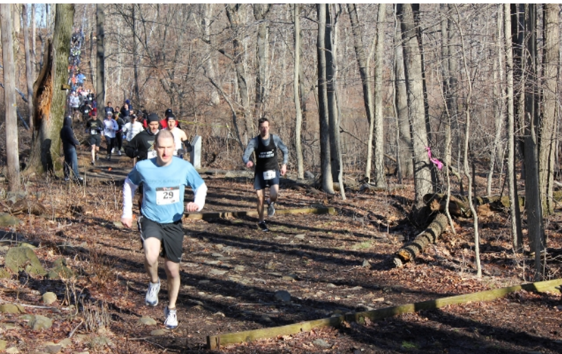
Trail Runners on Tenafly Nature Center's Main Trail during the Lost Brook Trail Run, April 2, 2011.

(Tenafly, NJ, April 2, 2011) 85 runners gathered at 9:00 am on Saturday April 2 to compete in Tenafly Nature Center's (TNC) first 5 and 10 mile trail race through the Lost Brook Preserve. The day dawned bright, cool and clear—runners came from far and wide throughout the tri-state area to participate in TNC's first trail race. Runners encountered rocky terrain and muddy conditions following the race routes through TNC's preserve, using the 7 miles of trails over its 380 acres of hardwood forest and wetlands. The trail race, a new venture for TNC, is one of a monthly series of keynote events held in 2011 to commemorate TNC's 50<sup>th</sup> Anniversary.